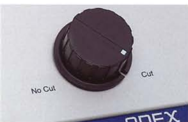
Cut/No Cut Knob