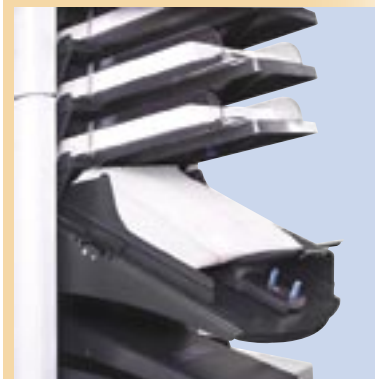
Optional Production Feeder