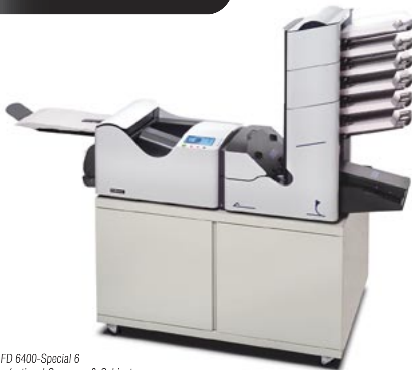
FD 6400-Special 6 w/optional Conveyor & Cabinet